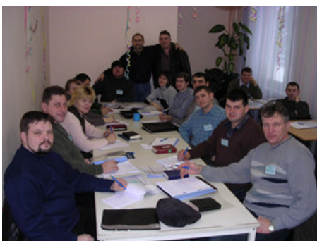
Church planters regular training day

three of us ended up sharing our compartment with an old grandmother, who was so scared of us that she wouldn't turn her