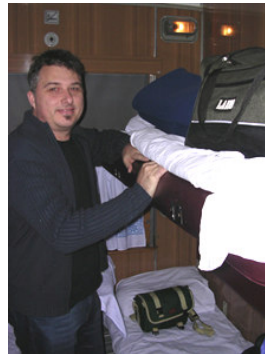
Overnight by train

and STM co-ordinators, ...in the banya . It turns out that the sauna is a favourite activity of the Ukrainian people and was there way to treat us to something special. Needless to say I slept extremely well that first night.