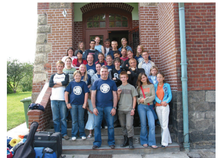
Polish and UK team ... with a couple of Aussies