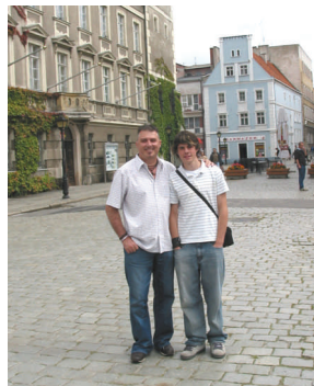
Aussie, aussie, aussie

Because of this work, 4 newspapers came and took photos and interviewed the team, we were also invited to meet the mayor of the region where we were presented with gifts to honour the