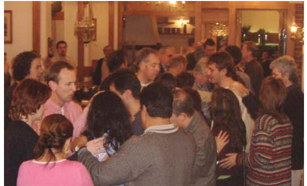
Commissioning the church planters

The ALTC (Advanced Leadership Training Conference), held in November 2005 in the picturesque and snowy mountains of central Slovakia, was a great success and encouragement to all who attended. Many months of searching and ministering in many churches across Slovakia have finally brought us to the stage of finding and selecting the Church Planters for the new Church Planting Project commencing in 2006. They were prayed for all together at the ALTC with the endorsement and encouragement from Pastors and leaders from around the nation. We are truly believing for a great project to emerge and indeed, as we have seen in the recent project in Western Poland, many testimonies of how God has both strengthened and