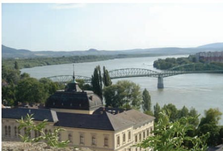
The Danube from Bratislava

mately 6,000,000 people with many towns and cities with minimal and in some cases no authentic Christian presence, the need for the